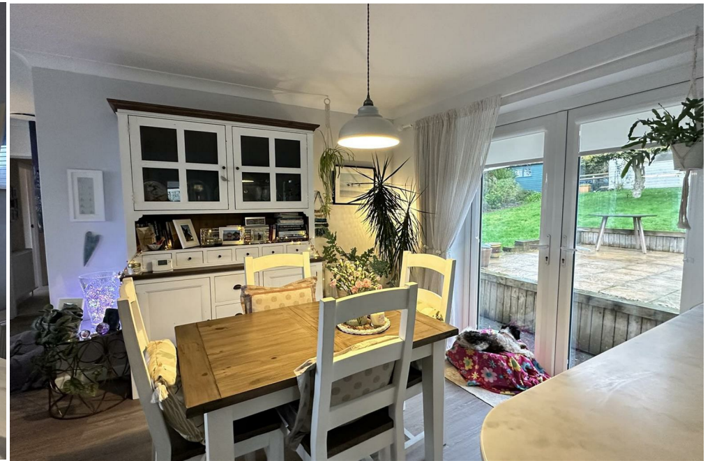
Hollies Road, Launceston, PL15 8HB